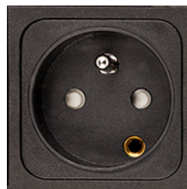
Outlet with earth pin