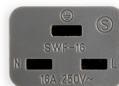
SWF-16 16A C19

Note! The connector must be connected to a wall socket with a ground terminal for the full LoRad effect to take place. Lorad are tested and certified by Intertek Sweden, meeting the European safety regulation HD21.5 S3.