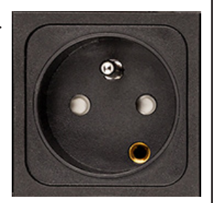
Outlet with earth pin